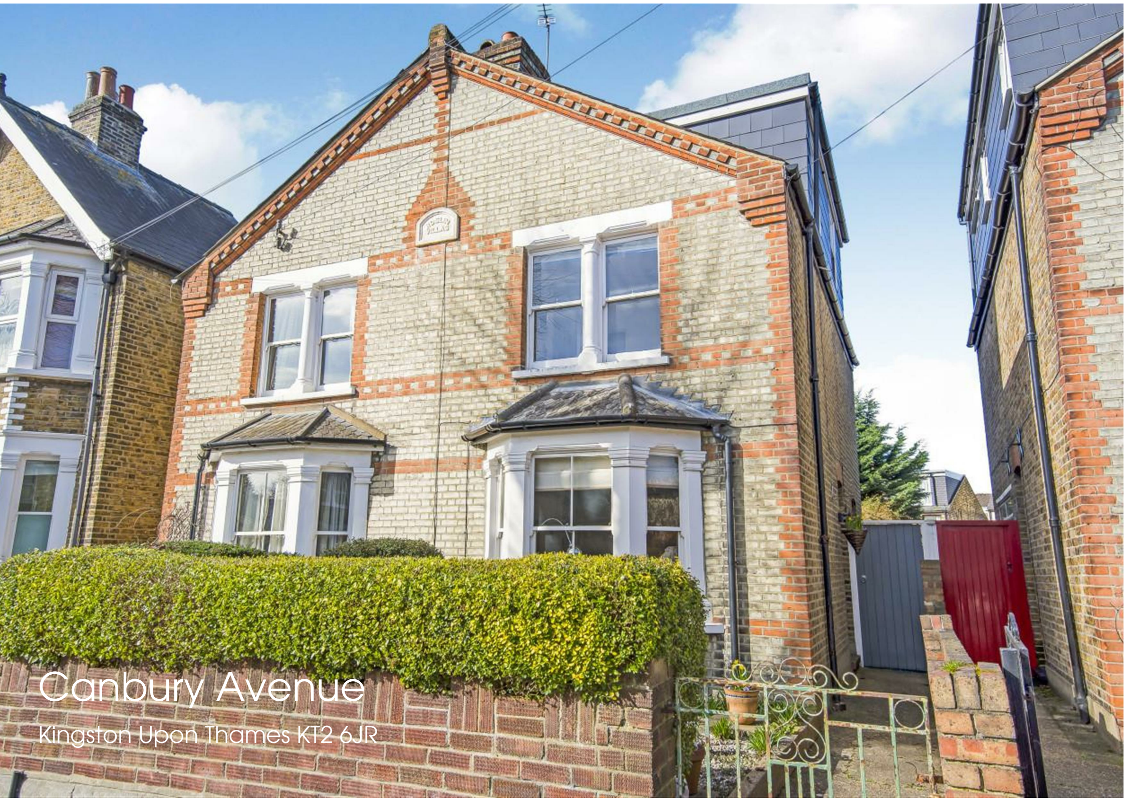
Canbury Avenue Kingston Upon Thames KT2 6JR